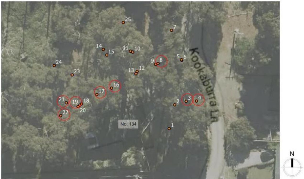
Figure 1: excerpt from Arborist report dated 28 September 2022 showing tree locations.